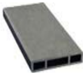
5/4 x 6 Radius