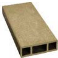
2 x 6

What fastener for each type of Nexwood deck board?