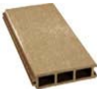
5/4 x 6 T&G